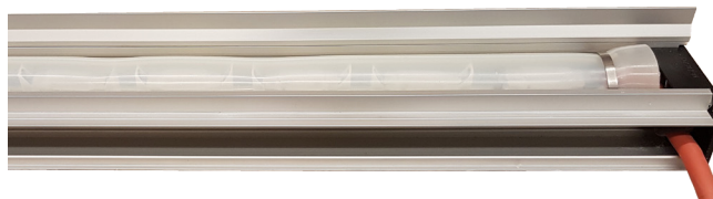
LL3TS / Xenon 3W/5W max.